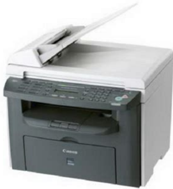
Canon ImageClass MF4100 Review

This laser flatbed three in one gadget, the Canon ImageClass MF4100, runs with impressive print speed for its classification, clocking in at 20 web pages per minute, as well as offers attractive attributes for copying, as well as scanning too, making it a superb buy for those trying to find a multifunction facility that does not include a fax modem.