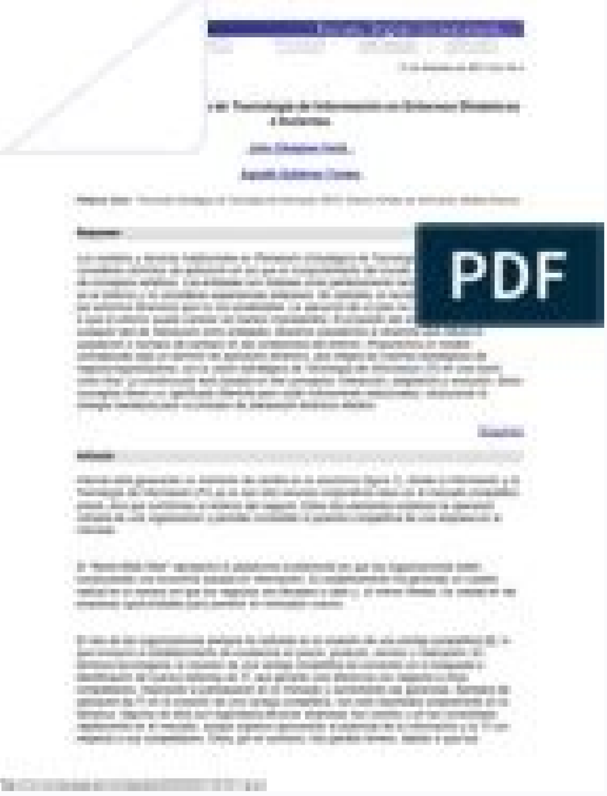
Guia ceneval egel informatica 2020. Guia-ceneval-egel-informatica-contestada. Guia ceneval egel informatica pdf.